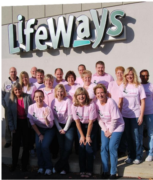
Photo: LifeWays Staff proudly participate in Pink Shirt Day.

Over 160,000 kids across the United States stayed home from school today because of bullies. Too often, bullying goes unreported and is perpetuated by the stigma associated with seeking help. In many cases, bullying can lead to suicide.