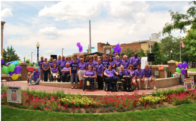
Photo: LifeWays Staff and Consumers join disAbility Connections to celebrate the ADA's 20th Anniversary.

On July 26, 2010, LifeWays Staff and Consumers joined a crowd of 75 people at Bucky Harris Park to celebrate the 20th Anniversary of the Americans with Disabilities Act (ADA).